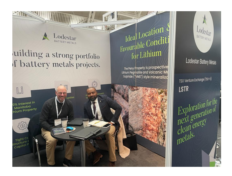
Lodestar's new branding on display at Mines and Money, London, UK, November 2022

In an effort to share our story and increase awareness of Lodestar, I have attended conferences and forged new relationships for the Company.